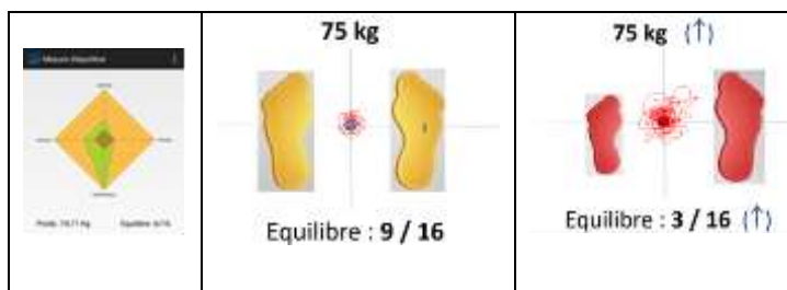
Figure 4. Previous interface (left), new interface (middle, right)

Accessibility emerged as a relevant factor to be addressed linked to the Usability research question because two distinct categories of end-users emerged out of this study: professional users and elder users. Elder users at risk of falling are those users whose age also implies reading, hearing and sometimes cognitive impairments. The idea was to make the two main information – weight and gait score – easily accessible to them, in terms of understandability and readability. Presented in a minimalistic way, the weight is simply indicated in terms of kilograms, and the gait score in terms of “balance”. These information are visible at a glance at strategic places – centre top and down – in a size big enough and sufficient contrast (black on white background, bold). It was also suggested that in some cases, to encourage patients' efforts, like undergoing rehabilitation in order to gain back some functional capacities or following a diet to lose or gain weight, it could be interesting to include the progression, in the form of arrows (Fig. 4, right). However, in the case of an ordinary everyday follow-up, this function would be avoided, in order to avoid discouragement effect.