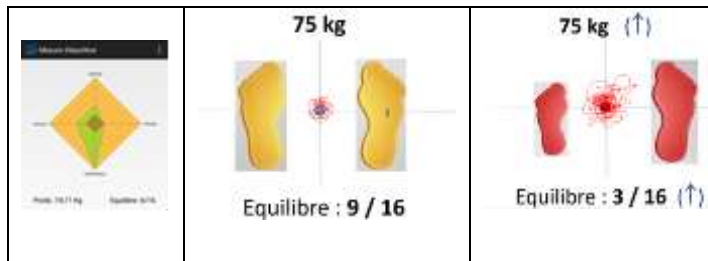
Figure 4. Previous interface (left), new interface (middle, right)

Another main insight is that the interface with the 4 indicators (Figure 4, left) was very difficult to understand and did not make any sense to the professionals: “ It doesn't speak to me ” or “ the way it's represented, it doesn't remind me of anything. ” This representation of information made even less sense to senior users.