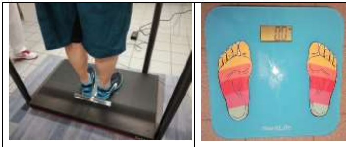
Figure 2. Left: highly standardized position of force-plate Right: standardization at home with BQT

The observation from the analysis of practices is that, contrary to the initial design and protocol of the BQT (see Fig 4, left), the force-plate strongly constrains the body position. The feet are positioned by the wedges inserted in the force-plate (Fig 2, picture left), and the patient is asked to look at the red line projected by the video projector in front at eye level. The position of the feet – glued knees, “duck” feet – is not very pleasant. However, looking at a fixed point in front in front of oneself, indeed, helps to remain more stable. The (till then) absence of any markings on the physical device of the BQT emerged from the collaborative sessions with the three professionals as being a failing, that required improvement.