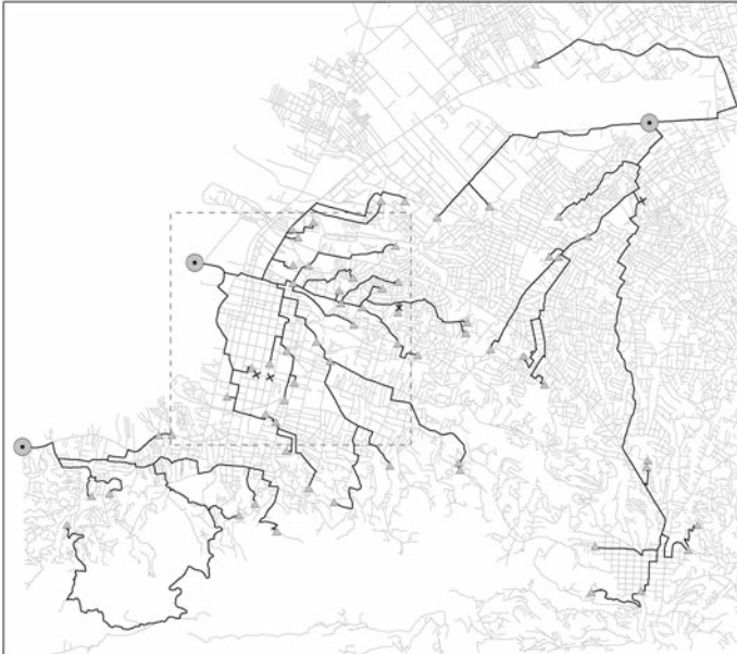
Fig. 5 SP from origins to destinations after the earthquake