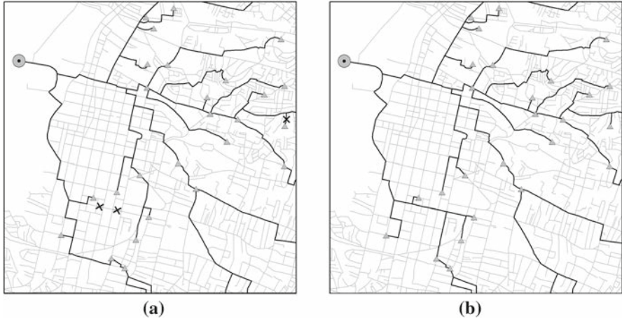
Fig. 6 SP in the area marked in Fig. 5 before (a) and after (b) first period repairs

It is important to mention that the time to allocate WT in the first time period plays a key role in real situations, since the algorithm has a whole time period to find the next-period allocation, once WT are sent. The processing times show that calculating the savings is a very time-consuming operation, making SH unfitted for large instances. RH and LCH used a similar amount of time to finish the first period allocation, but later on the smaller edge lists generated by LCH make the heuristic faster than RH, whose edge ranking has a O(|B|) size. These two heuristics present computational times acceptable for use in real operations.