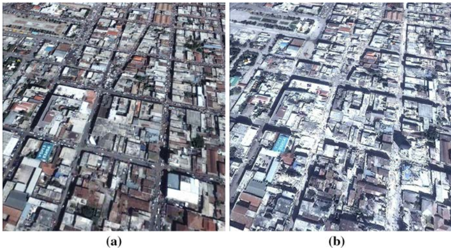
Fig. 1 One sector of Port-au-Prince 1 day before (a) and after (b) the 2010 earthquake

In this context emerged the project Optimization of Logistics Interventions for major Catastrophes (OLIC), a collaboration between the Industrial Systems Optimiza-