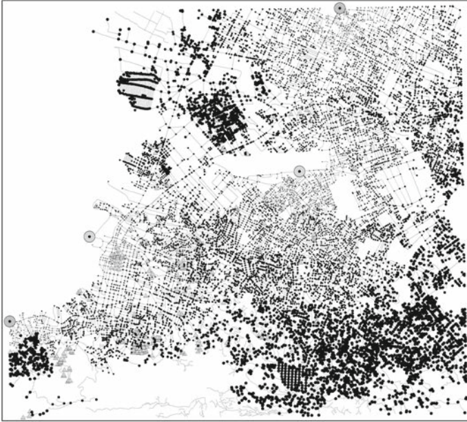
Fig. 4 Gradient map showing the initial accessibility of the road network