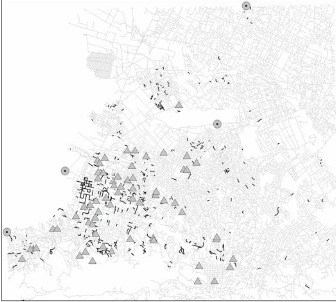
Fig. 3 Port-au-Prince road network after the 2010 earthquake. Circles, triangles, and dark edges represent origins, destinations, and blocked roads, respectively

Two attributes were obtained for each node of the network. The first is the node type, three-folded into: regular node; entry point by road (main access road), sea (port), or air (airport); and spontaneous gathering zone or camp. The two last types of nodes correspond, respectively, to our models set of origin and destination points ( O and D ). The second attribute concerns the nodes corresponding to the gathering zones, and contains the population p_i on that node, computed based on the amount of tents visible in the satellite images.