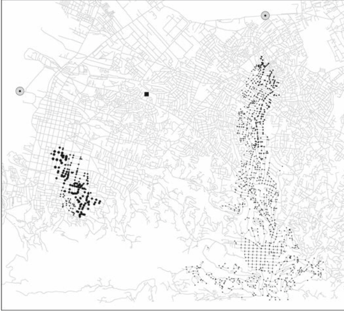
Fig. 7 Accessibility improvement after the first period repairs

for problems that compose the RERP are presented: the first one deals with the Road Network Accessibility Problem, allowing a decision maker to determine very quickly the accessibility of population gathering areas, by means of SP algorithms, such as Dijkstra. The second model concerns the Work-troops Scheduling Problem, generating WT allocations per time period to repair blocked edges of the damaged road network. Using both models, it is possible to know if the population is reachable after an earthquake and to improve their accessibility for relief teams from some origin points.